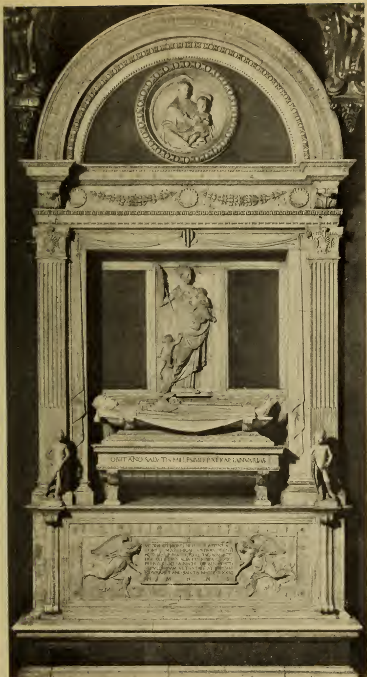
MONUMENT TO COUNT UGO BY MINO DA FIESOLE IN THE BADIA